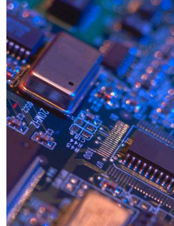
TEAMS-RT, QSI's real-time diagnostic reasoning engine can be embedded in the system hardware for onboard diagnostics.

TEAMS-RT, an ultra-fast, ultra-compact embedded “reasoner” uses system information from the TEAMS model to perform diagnostics in real time and generate system health assessment continuously.