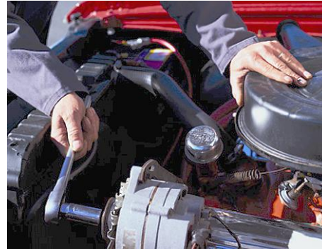
QSI's solutions simplify vehicle repair and maintenance

QSI has a wealth of experience building advanced health management solutions for high technology complex equipment manufacturers such as FEI Inc., Orbotech, Ltd. and others.