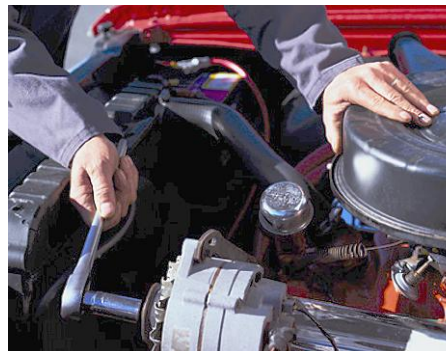
QSI's solutions simplify vehicle repair and maintenance

QSI has a wealth of experience building advanced health management solutions for high technology complex equipment manufacturers such as FEI Inc., Orbotech, Ltd. and others.